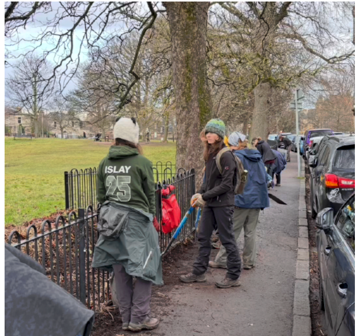
Students (43 Dirty Weekenders) clearing growth and leaves at base of railings and pavement.