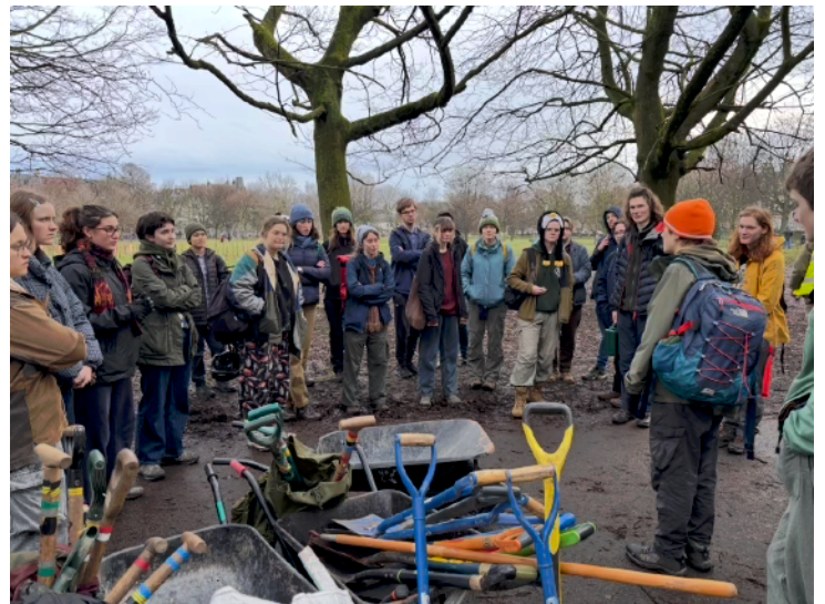
Volunteers being briefed