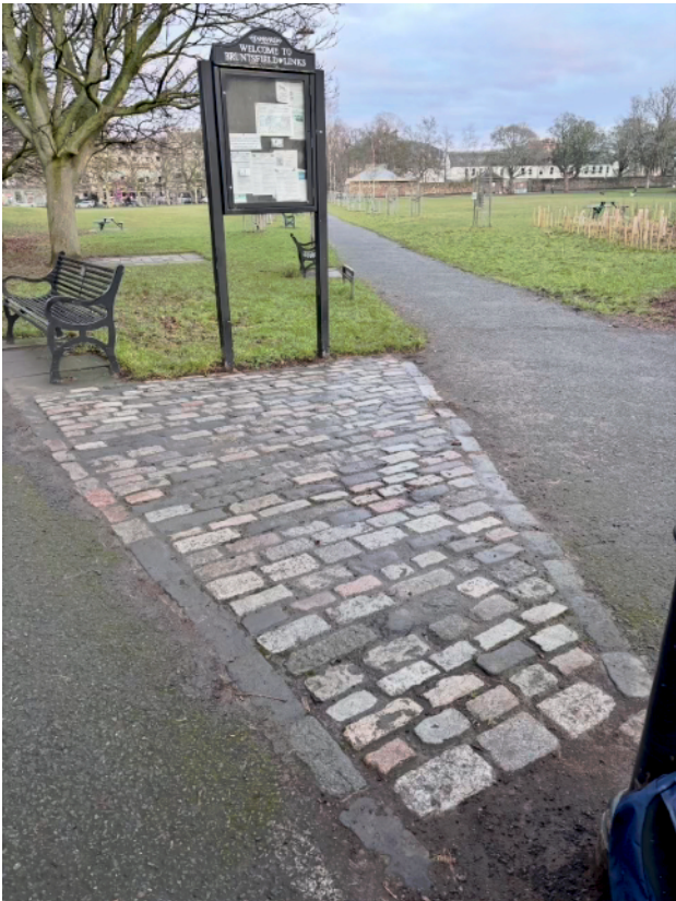
Setts cleared by local scout group

We have had great help from scout groups and University students ( Dirty Weekenders ) who have cleared a lot of growth around railings and other areas which used to be sprayed with weedkiller. Unfortunately CEC do not have the resources to manually clear grass at edges or rotting leaves on pavements. FoMBL (NR) will continue to use these excellent, enthusiastic volunteers whenever possible.